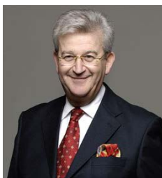
Christos Folias Minister of Development

For more information for previous events, please visit: www.tsomokos.gr