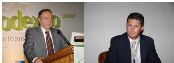
Themistoklis Xanthopoulos Deputy Minister for the Environment, Physical Planning and Public Works