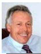
Lazlo Borbely Minister of Development, Public Works and Housing Republic of Romania