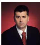
Branimir Gvozdenovic Minister for Economic Development Republic of Montenegro