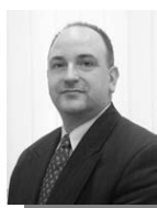
Dr. Milan Parivodic Former Minister of International Economic Relations & Finance Republic of Serbia